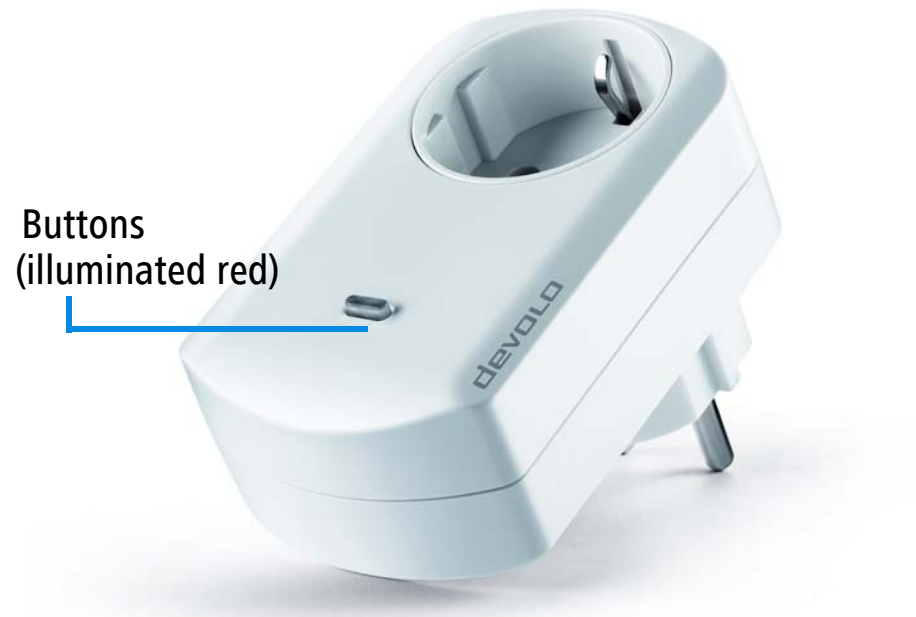
Figure is country-specific

The Home Control Smart Metering Plug can be plugged into any wall outlet in the home. It enhances every connected device with useful functions, such as time-controlled enabling and disabling of power monitoring.