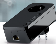
Single Adapter Art.: 9557 (EU)